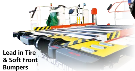
Lead in Tire & Soft Front Bumpers

SINFONIA TECHNOLOGY CO., LTD. continually upgrades and improves its products. Actual features and specifications may therefore differ slightly from those described in this catalog.