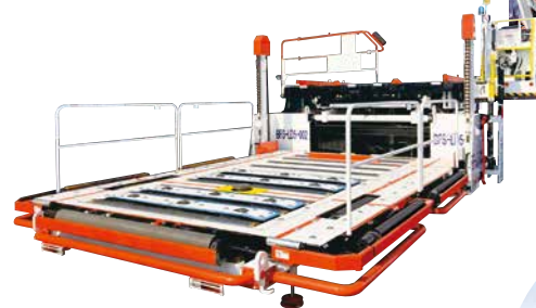
Main Platform Design